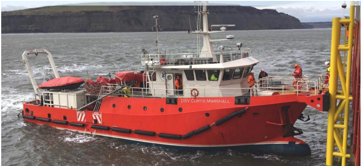
Figure 3: DSV Curtis Marshall Vessel.

The vessel that will carry out the survey activities is shown below.