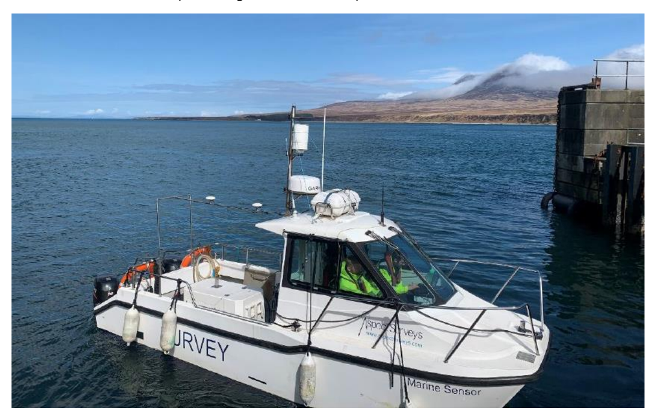
Survey Vessel - Marine Sensor

The Vessel - Marine Sensor performing the Nearshore Scope of Work is detailed below.