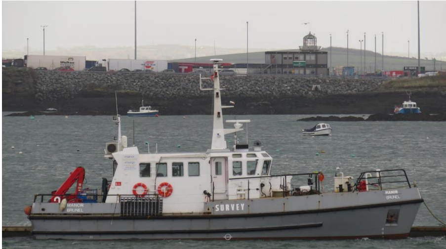
Figure 2: S/V Manor Brunel.