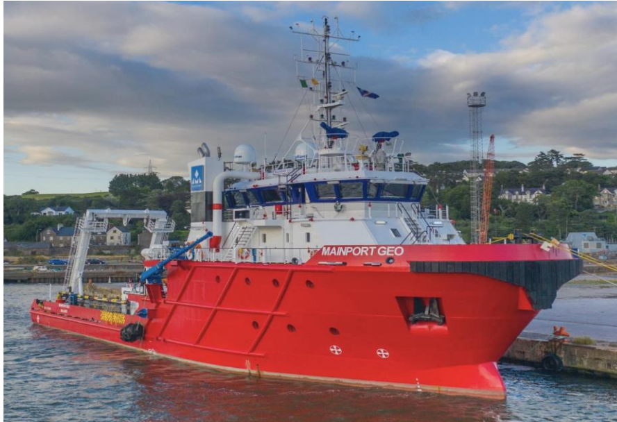
Figure 2: R/V Mainport Geo.

The vessels that will carrying out the calibration activities are shown below.