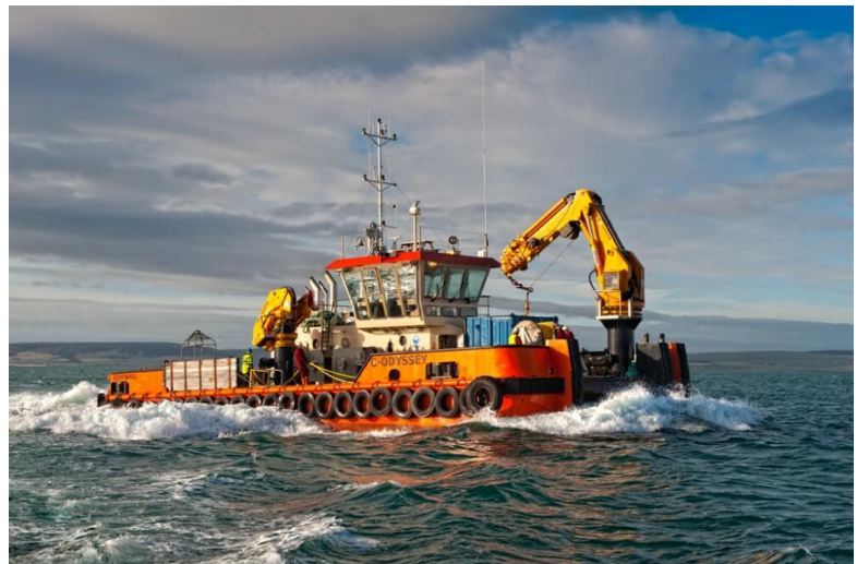
Figure 2: C-Odyssey

Name: C-ODYSSEY Length: 26m Breadth: 10.1m Draft: 3.8m Call sign: 2ETW7