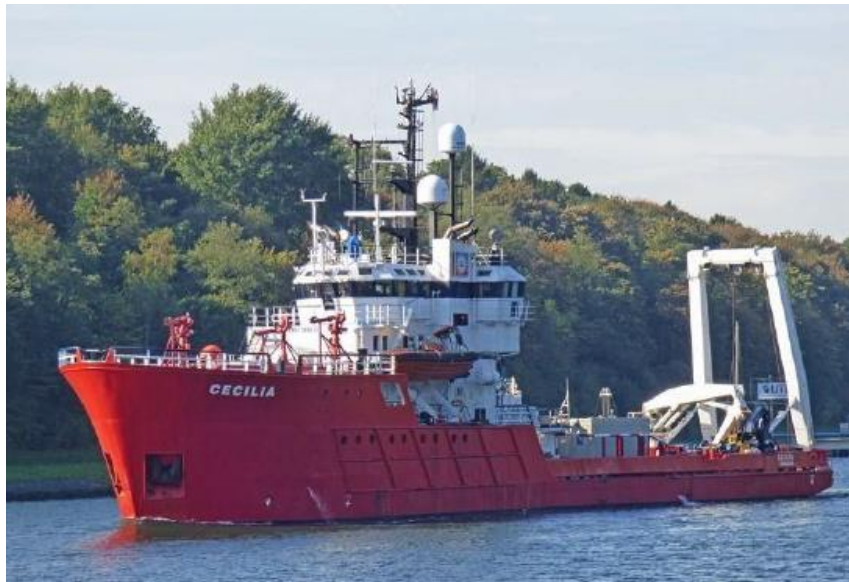
Figure 2. Northern Cecilia