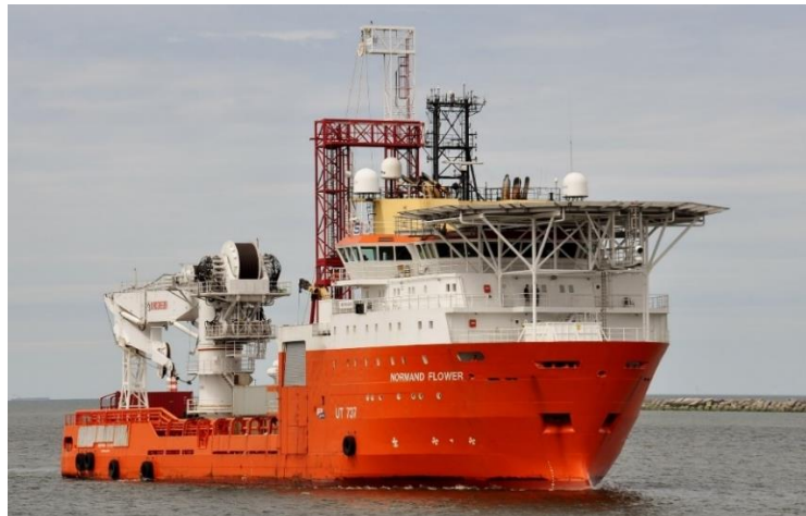
Figure 2. Normand Flower