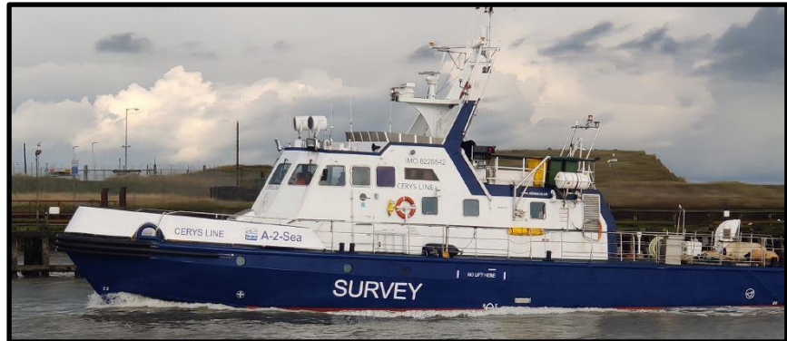
Figure 3: Vessel Cerys Line

Name: Cerys Line Length: 26.2m Breadth: 6.0m Draft: 2.1m Call sign: MGMMR5