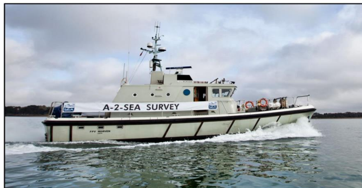
Figure 4: Vessel Morven

Name: FPV Morven Length: 20m Breadth: 6m Draft: 2m Call sign: MBFQ6