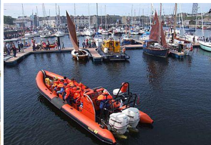
left-right : Echo, Orage, Caithness Seacoast